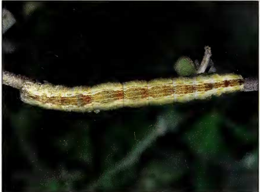
Fig. 7. Larva of Rhynchina canariensis in the last Fig. 8. Larva of Rhynchina canariensis in the last instar (dorsal view).